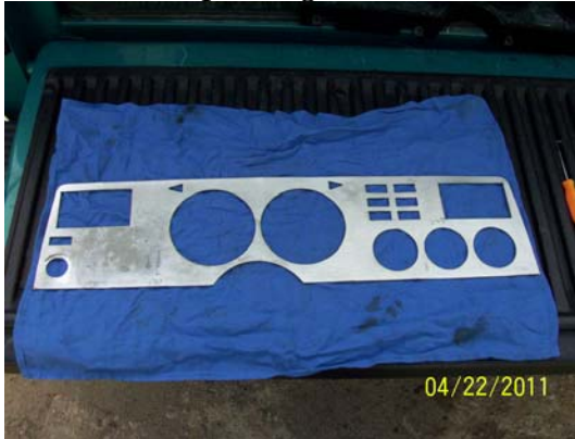
Original insert removed from bezel

The first step in this repair was to carefully remove the old insert without breaking it as it was to be used as a template for the new piece. I used a small 90 degree pick to get under the insert and very carefully started to work the pick through the glue that held the insert in place. This step was time consuming but the insert was finally removed intact and was ready to be used as a template. The same process was used to remove the inserts on the passenger side bezel as well.