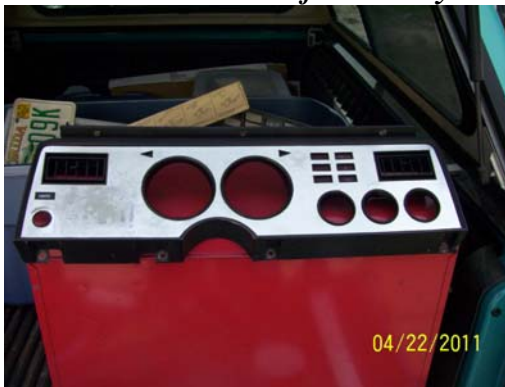
Original brushed aluminum insert

The dash on my 1978 Mustang had a wide variety of insert options. Some options were a light or dark wood grain finish, brushed aluminum etc. When I bought my car the previous owner had covered the dash with a wood grain contact paper that at first I thought was original until I did some research on the car. For years I left it as it was and finally decided that I wanted the original brushed aluminum look back. I peeled off the contact paper and found out that the previous owner had covered it for good reason. The original brushed aluminum was really worn in places and looked real bad. The inserts are made of thick vinyl and are glued to the dash bezel.