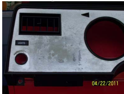
Wear on left of dash