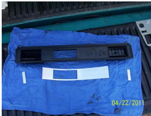
Passenger side bezel disassembled