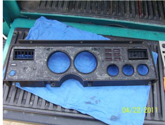
Dash bezel without insert